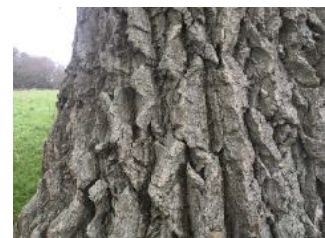
Lucombe oak in three pictures